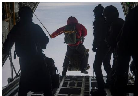
Photo of the Day: Alaska National Guard Airmen, of the 212th Rescue Squadron, jump out of a HC-130J Combat King II in response to a simulated alert rescue call during Exercise Arctic Eagle 2020.

*If you find Alaska National Guard news that was not included, please forward the link so it may be added to the next update.